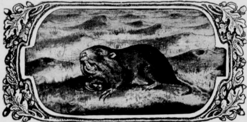
THE POCKET GOPHER.

Carbon bisulphid has been employed for killing pocket gophers, and under favorable conditions its use is recommended. If the burrows are extensive