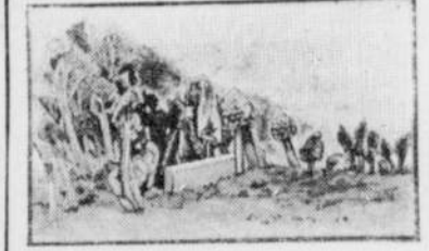
FORCED AND UNFORCED RHUBARB.

Experiments have shown that the most satisfactory results in cultivating rhubarb, are attained by growing the roots from seed and forcing when the plants are one year old. Drying the roots has been found to have the same effect as freezing. Either drying or freezing serves the same purpose as a long rest, which is otherwise required, and the product is more vigorous.