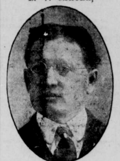
Candidate for Republican Nominee for State Treasurer.