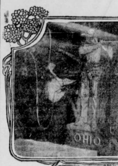
A MASTERPIECE SHAPED BY PNEUMATIC TOOLS.

The field of Gettysburg and the other scenes of strife in our great Civil War are rapidly being filled with memorials in granite, marble and bronze, which will greatly enhance the interest of these national parks for all visitors and particularly for those