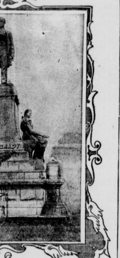
THE GRADY MONUMENT AT ATLANTA, GEORGIA.

Moreover different styles of pneumatic tools are provided for the various classes of work to be performed in producing a statue or other monument. For instance, there is one tool for light carving, tracing and lettering on granite, and a different one for heavy carving and large raised letters. The tools require from five to seven cubic feet of free air per minute to operate them. In the battlefield memo-