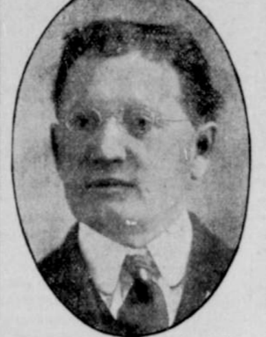
Candidate for Republican Nominee for State Treasurer.

part of the Holstein literary bureau to bolster up the fallen cause.