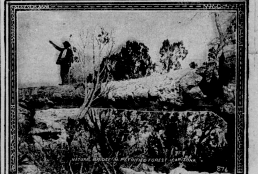
NATURAL BRIDGE IN PETRIIFIED FOREST, ARIZONA.

In the past few years the log has begun to show signs of yielding to that peculiar inclination of all petrified trees to crack up into immense pieces; in fact, in several places transverse cracks have already appeared. The Government, in order to preserve