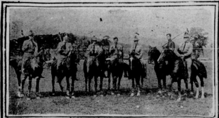
The Cadets Become Expert Polo Players and Swordsmen.

For one thing the new buildings will provide accommodations for 1,200 cadets, instead of for 450 as at present, and these new structures will also include a new gymnasium, riding hall, academic building, cadet headquarters, etc., as well as a handsome hotel for