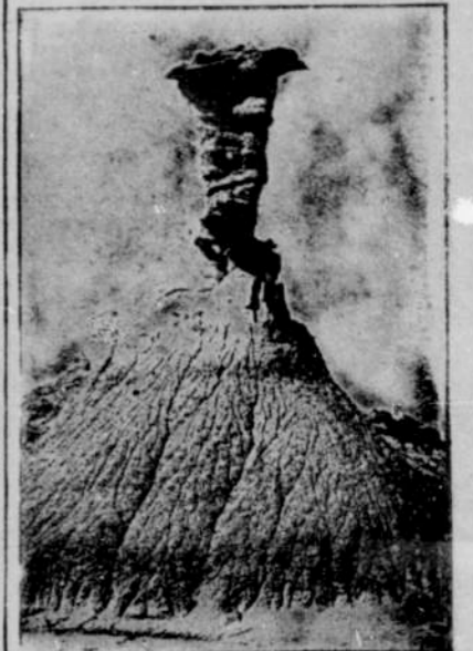
PETRIIFIED SENTINEL OF THE MESA.

Among the color seen are every conceivable shade of black, red, white,