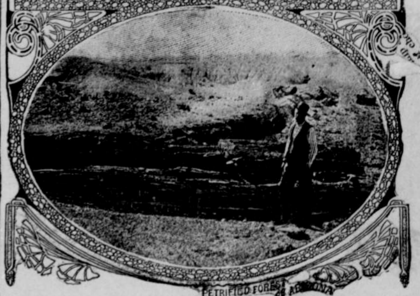
PETRIIFIED FOREST, ARIZONA.