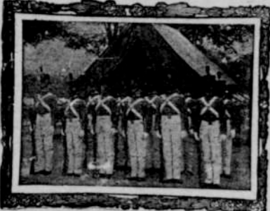
GUARD MOUNT AT WEST POINT.

The United States Military Academy at West Point has long enjoyed an international reputation as the finest training institution in the world, and this prestige will be considerably enhanced upon the completion of the large scheme of improvements now under way and upon which Congress will expend more than seven million