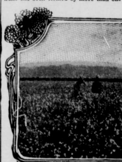
AN OCEAN OF SWEET PEAS. Flower Seed Growing is an Extensive Industry.

The Agricultural Department is busier than usual sending out millions of packages of free seeds for Congressmen. It should be understood that this free seed distribution, while carried out by the Secretary of Agriculture, is no scheme of his, but is a Congressional affair, pure and simple. In every session there is one or more bills introduced abolishing what has been termed by more than one