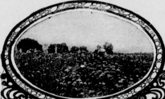
A Field of Seed Lettuce.

The Department of Agriculture in order to aid farmers to determine for themselves without much trouble the germinating qualities of seeds purchased by them, has issued a number of bulletins upon the subject. A very simple apparatus for sprouting seeds is described in the bulletin. It consists of a shallow tin basin or one of granite ware. The bottom of the basin is covered with water and a small flat bottom of porous clay is placed inside. The seeds after having been soaked are laid between two layers of moist blotting paper or flannel cloth. A pane of glass covers the dish, which is to be kept in a temperature of about 70 degrees. The atmosphere of an ordinary living room is suitable if care is taken to set the apparatus near a stove at night. The basin may be left