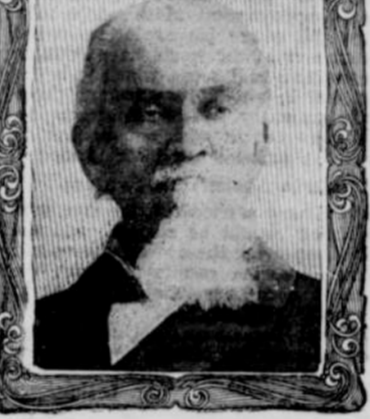
SENATOR PETTUS, The Nestor of the Senate.

Mr. Morgan has been in the Senate since 1877—nearly 30 years—and he has been recognized as one of the leading spirits in that chamber. While he