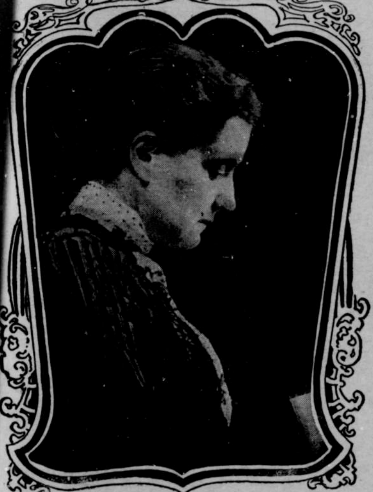
THE "PATRON SAINT" OF HULL HOUSE.