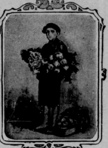
HE RAISED THEM HIMSELF.