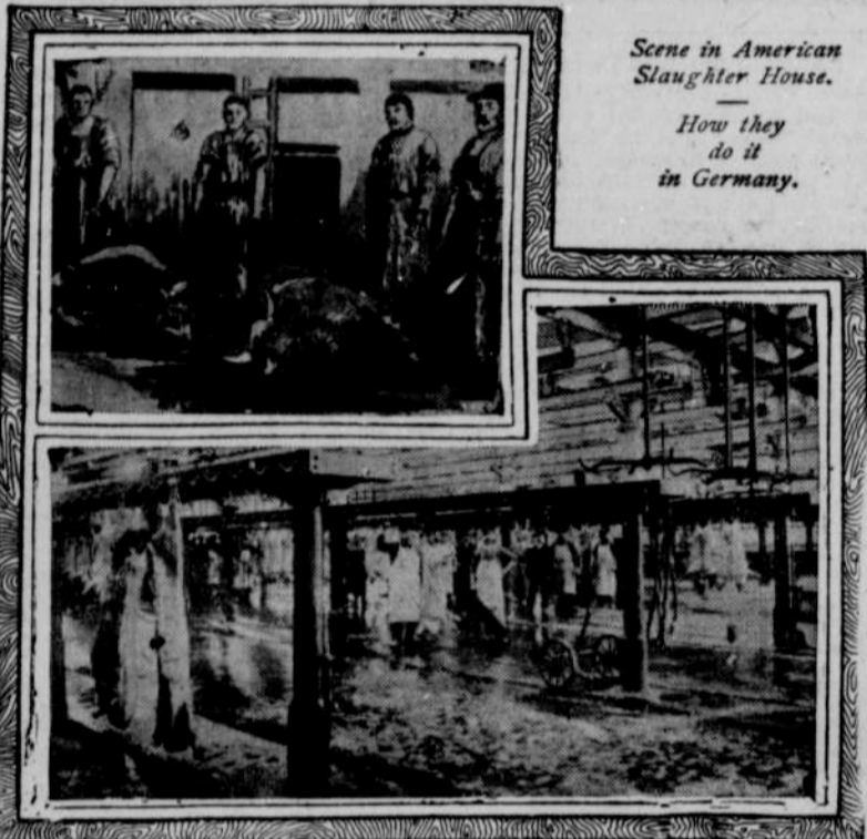
Scene in American Slaughter House. How they do it in Germany.

The latest work upon which the United States Weather Bureau has entered is a system of meteorological observations from vessels at sea by wireless telegraphy and the simultaneous issuance of weather forecasts and storm warnings to those vessels. The Weather Bureau has prepared a special code by means of which exact information as to date and hour, latitude and longitude of the vessel, atmospheric pressure, temperature, force and direction of the wind, and the character of the sky are all compressed into four words. As soon as any coast wireless telegraph station receives such dispatch from vessels, the message is to be delivered once to the Weather Bureau at Washington. Should the contents of this message be of such importance as to demand special storm warnings, notices will be prepared and dispatched by wireless telegraphy to all vessels in the vicinity affected. The value of such a service might be cited when the experience of the steamship Campana is remembered. On October 11 last, this liner was caught in a hurricane. The storm was found to have had no great area and it is stated by the Weather Bureau that had the system proposed been in use at that time, warning of its existence might have enabled the Campana and other vessels to avoid its center of activity. Another feature of great value in this