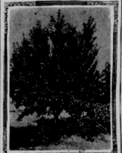
A PROFITABLE APPLE TREE.

Apple Growing. The Department of Agriculture often receives communications from farmers who are maintaining that the practical agriculturist does not have much faith in experiments conducted at experiment stations, as they are on such a small scale that great weight cannot be attached to the results. The statement is made that these experiments made on a large scale or under conditions such as confront the farmer himself, they might prove more valuable. Taking this standpoint as a rule to follow the New York experiment station through the Department of Agriculture has reported the results of an examination of 1,133 apple orchards covering 8,642 acres in Wayne and Orleans counties, New York. Both of these counties are extensive apple growing regions. In one township every or-