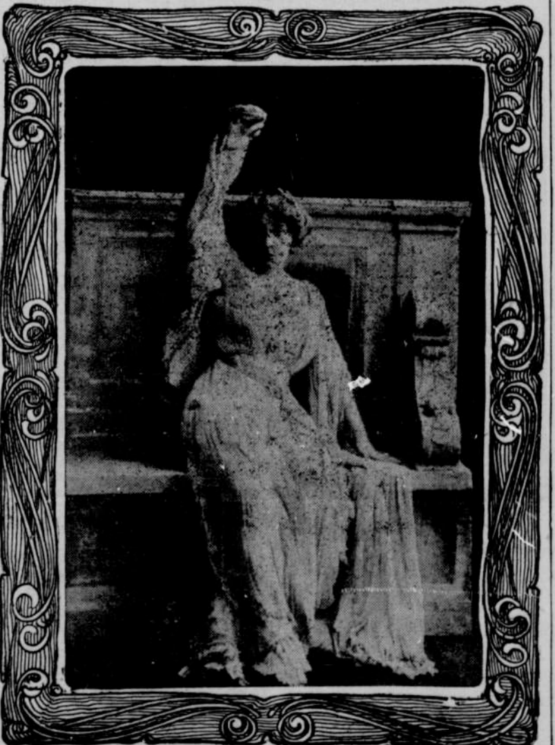
MISS OLGA NETHERSOLE.

"It's just like you," said the bookkeeper simply.