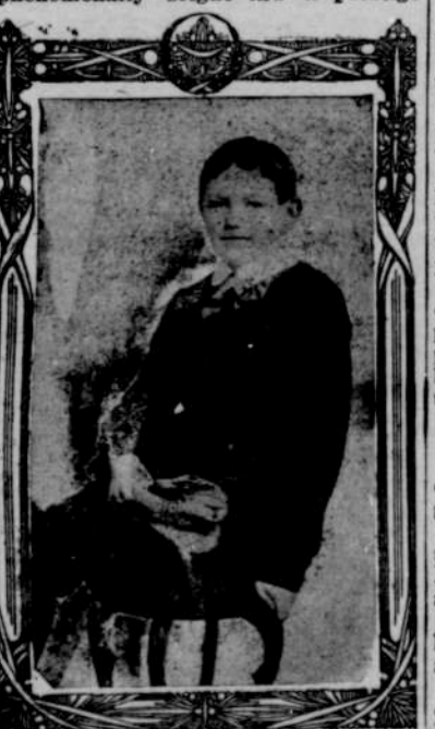
GRANDSON OF PRESIDENT GARFIELD.