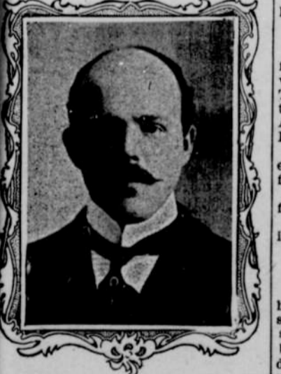
HON. NICHOLAS LONGWORTH.

On the death of her mother, one year after the latter's marriage, Miss Roosevelt