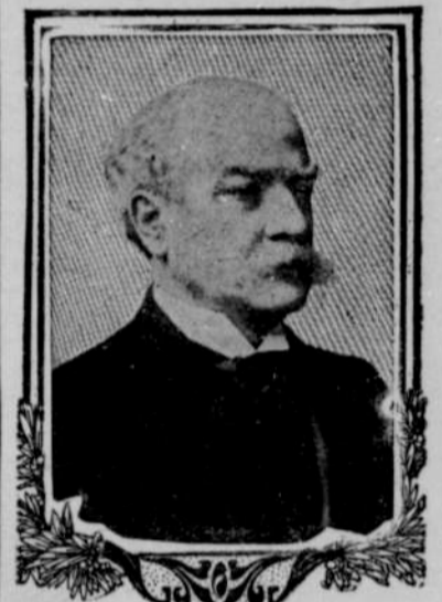
HON. ETHAN ALLEN HITCHCOCK, Secretary of the Interior.

Then when Colonel Roosevelt became President, the irrigation bill was passed and the administration of the law was entrusted to the Interior Department. Mr. Hitchcock was ready. The Geological Survey, a bureau of his department, had been making extensive surveys and in reality, getting ready for such a law, so that work was immediately commenced and instead of eight or ten years of prepara-