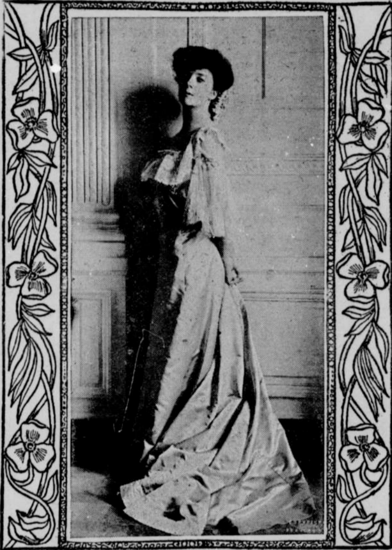
MISS ALICE ROOSEVELT.

Upon the completion of his course at Harvard, Mr. Longworth studied law in the Cincinnati Law School, and was admitted to the bar in 1894. He served as a member of the school board of his home city until elected to the Ohio House of Representatives in 1899, by the incredibly small majority of 4, being the only Republican elected that year. Subsequently he served in the State Senate until elected to the Fifty-eighth Congress, and was re-