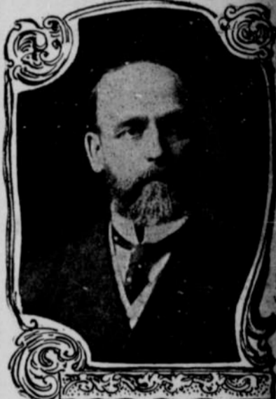
FREDERICK H. NEWELL Chief Engineer of the U. S. Reclamation Service and Member of the Public Lands Commission.

The following part of the report of the Public Lands Commission shows that the commutation clause at present is a farce and that land can be entered under it and almost immediately added to already large individual holdings. The Commission recommends that the period of residence be extended from fourteen months to three years and that the residence be actual and not constructive, as it is at present. With such a law strictly enforced the evils of the commutation clause would be largely obviated. It is, however, highly improbable that if a man actually resided and improved his homestead for three years