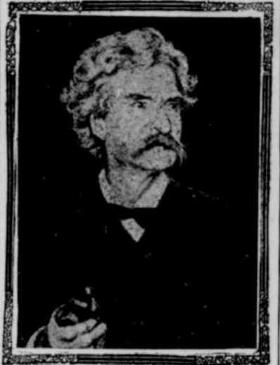
MARK TWAIN, TO-DAY.

Mark Twain, that prince of humorists has reached the limitation of life as laid down by the Scriptures--three score years and ten. And yet he is still able to give us gems of humor and wit--such gems as attained fame for him years ago when Huckleberry Finn, Tom Sawyer and Innocents