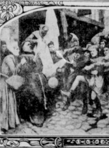
AN ANCIENT FOOTBALL GAME IN THE STREETS OF LONDON.

A virgin is a maid; when verging on 30 is called an old maid.