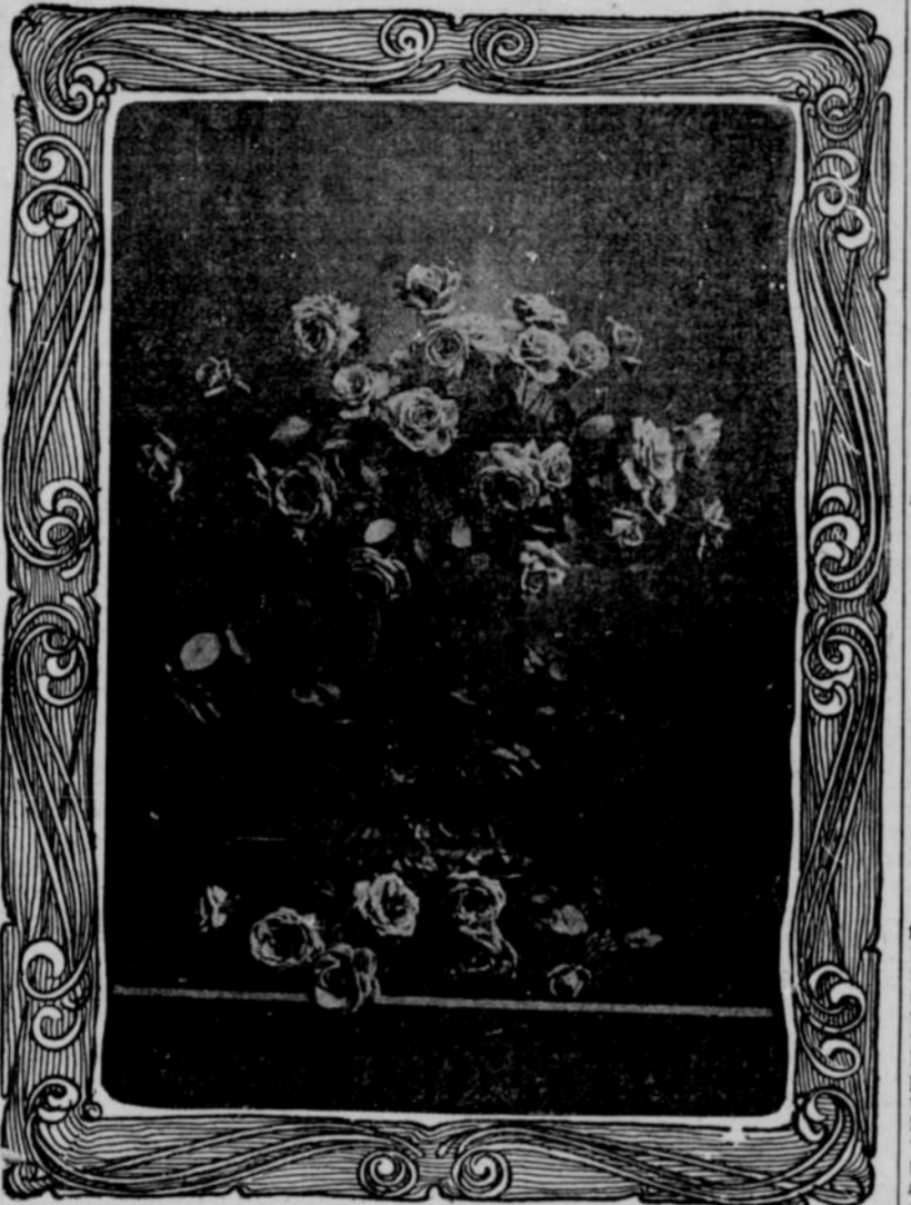
THE NEW QUEEN BEATRICE ROSE.