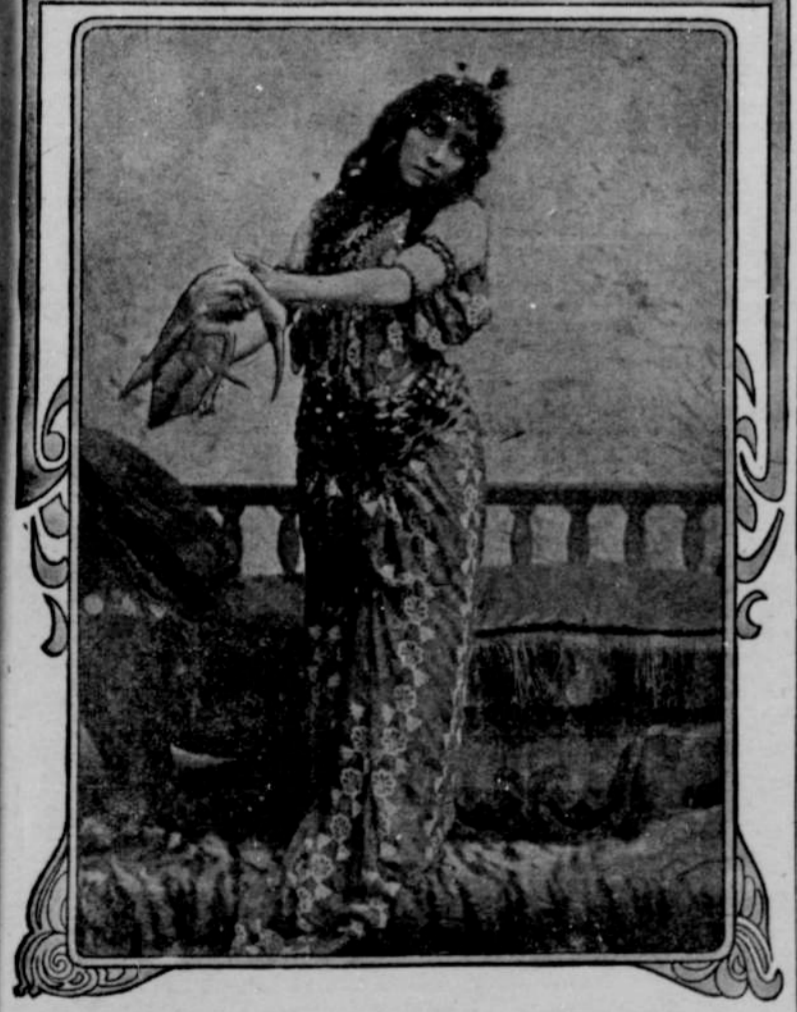
THE UNCONVENTIONAL SARAH.

To the Senate and House of Representatives: I submit herewith the second partial report of the Public Lands Commission, appointed by me October 22, 1903, to report upon the condition, operation, and effect of the present land laws, and to recommend such changes as are needed to effect the largest practical disposition of the public lands to actual settlers who will build homes upon them and to secure here concluded to submit this second partial report bearing upon some of its permanent the fullest and most effective use of the resources of the public lands. The subject is one of such magnitude and importance that I the larger features which require immediate attention without waiting for