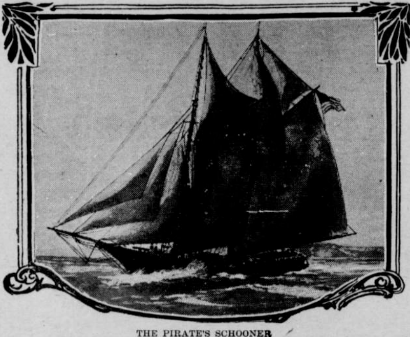
THE PIRATE'S SCHOONER