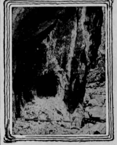
MAKING A CANYON ROADWAY.

Below the canyon where the river runs more peacefully, all these formations are represented in the huge beds of cobble stones and smaller boulders over which the water plays. The cobblestones were themselves once jagged rocks, detached by wind, water, frost and sun from their mountain bases, and rolled and ground by river force