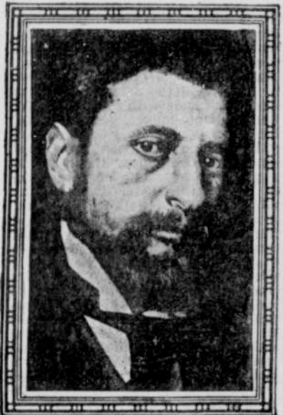
H. RIDER HAGGARD.

Colonization Work of Salvation Army At these three points the Salvation Army has established rural settlements, taking worthy poor from the overcrowded cities, furnishing them with small tracts of land, sufficient money to get a start and make homes