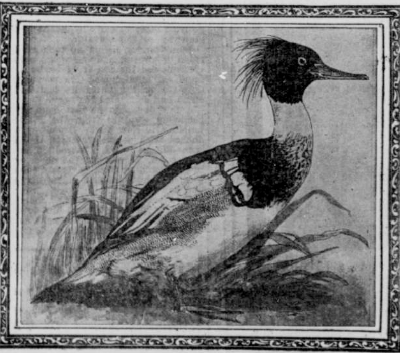
THE MERGANSER WILD DUCK.

The longest bridge in the world is the Lion Bridge, near Sangong, China, supported by over 300 huge stone arches and extending five and one-quarter miles over the arm of the Yellow Sea.