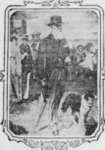
KING LEOPOLD OF BELGIUM.