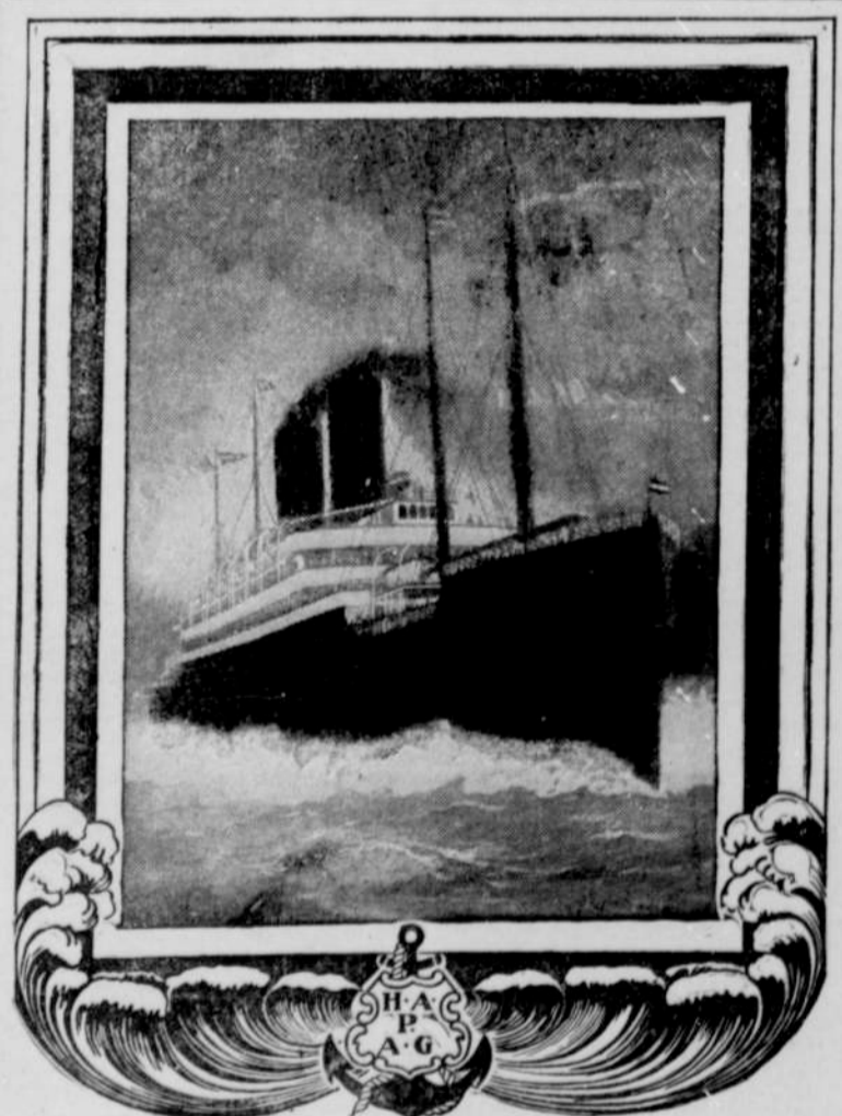
A NEW SEA GIANT.

Hush, baby, hush! It is time you were winging Your way to the land that lies—no one knows where; It is late, baby, late; Mother's tired with singing, Soon she will follow you there. Hush, baby, hush! E. O. COOKE.