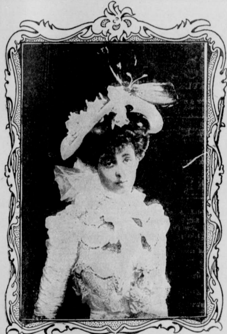
CONSUELO, DUCHESS OF MARLBOROUGH.

A contributing cause to the falling at the weather bureau is the activity of the long-range prophets. The superior usefulness of a forecast for next month over one for tomorrow being manifest, even sheer guesswork for the former period is preferred by thousands to a scientific determination for the latter. Recently a moneyed individual offered a substantial prize for the best weather prophecy six months ahead. If the Government bureau should try for that and win it—and it ought to be able to guess as well as anybody—it would become the most popular institution in the country.