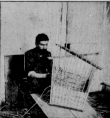
MAKING WILLOW HAMPER.