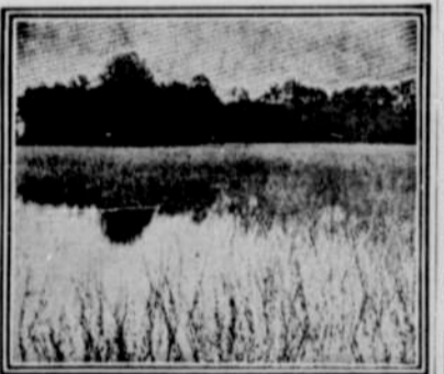
A WILLOW SWAMP.

The general idea is that willows will grow only on very swampy ground, but experience shows that all serious attempts made on well-drained soil, even though of poor quality, have been successful. The ground is prepared just the same as it would be for corn or wheat. Willow planting generally is done in the autumn; should be in rows, the sets or cuttings, according to older methods being placed about ten inches in length and planted in the ground until about only an inch and a half protrudes above the ground. Almost without