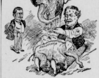
From Washington Post.

It seems to be generally accepted that the control of all matters in connection with the construction of the Panama canal is to be transferred from the War Department to the State Department. Under the law the work is to be performed under the direction of the President, and he originally intrusted it to Secretary Taft on the general ground that all national engineering works were properly the business of the War Department. It is now realized that Secretary Taft has a great deal more than his pro-