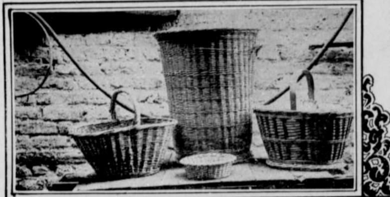
American Baskets Made in Richmond, Virginia.

And yet, the farmer may ask, is there a market for willow ware in this country? The United States consumes the largest amount of willow ware of any country in the world. From one district in Germany alone, as far back as 1883, in spite of the panic existing at that time, $250,000