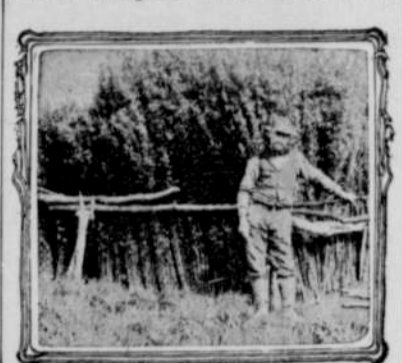
WILLOW IN THE PIT, SPROUTED, READY FOR PEELING.

Dr. Harvey W. Wiley, the chief of the Bureau of Chemistry of the Department of Agriculture, has just returned from a tour of the British Isles, France and Germany, where he has been studying the preparation of food products—packing, shipping, and human consumption of foods. Dr. Wiley is a pure food man. He believes that we should all have pure food, or at least know what it is adulterated with, and he is one of the most active advocates in the country of national pure food legislation.