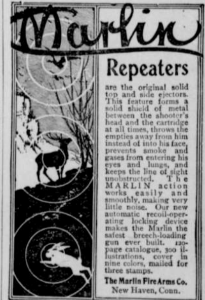
The Marlin Fire Arms Co. New Haven, Conn.

SEND FOR CATALOGUE WILLIAM BROS., Ithaca, N. Y.