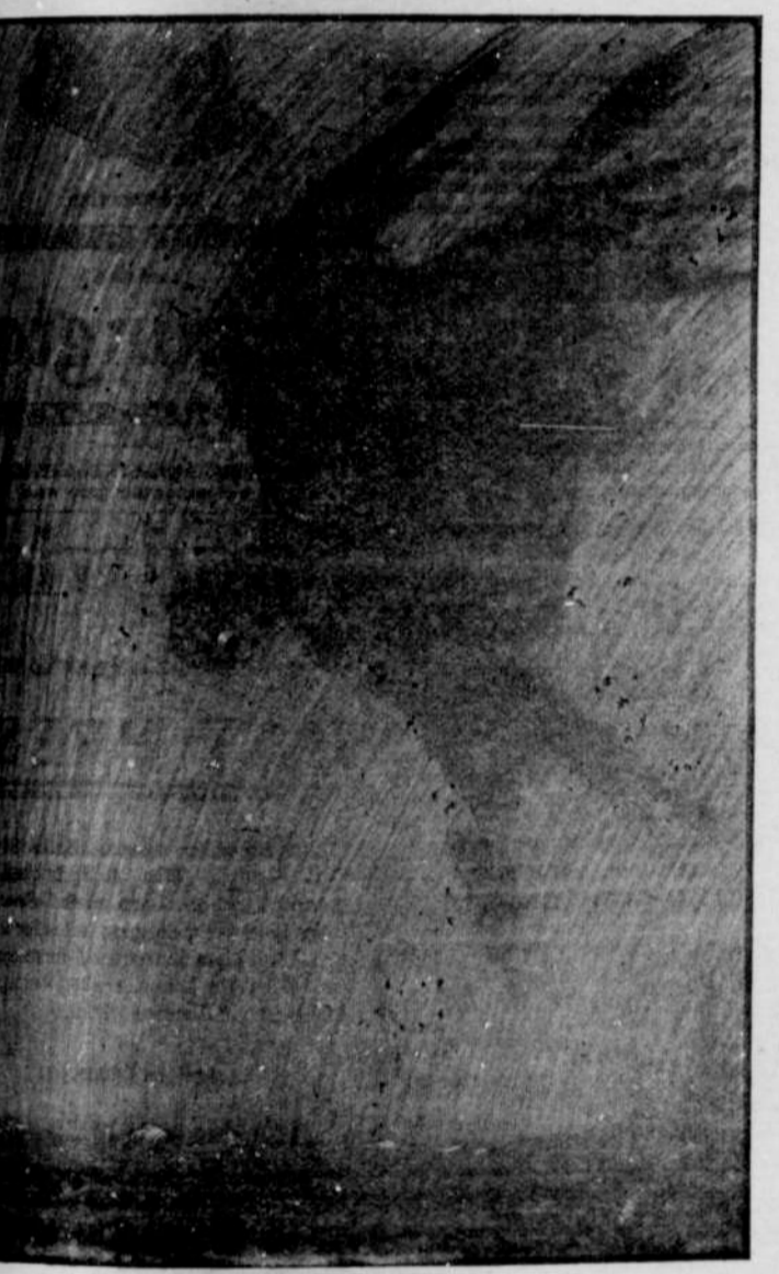
THE GREAT ONG.

The old Indian woman glanced nervously at the distant sky line, and entered her gaze upon the deep waters of the lake. The Ong said, I will tell you of the Ong. The Ong was a huge bird, greater than the houses of the white men. Its wings were longer than the tallest man. Its face was that of an Indian, but covered with hard scales, and its feet were webbed. Its nest was deep down in the bottom of the lake, out in the center, and out of the water, there are no rivers to the lake. There are no rivers to the lake, only the waters from the Ong's nest. All the waters flow near the bottom, in great under-currents, and after passing through the meshes of the nest are sent forth again. Every plant and bird and animal that gets into these under-currents, and sometimes even the great fish, are swept into the meshes of the nest and are there held fast to furnish food for the Ong.