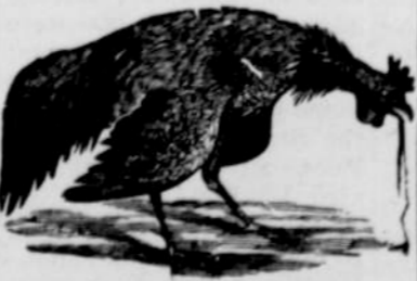
Who will feel like this next week?