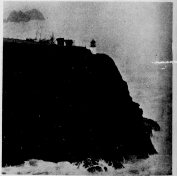
CAPE MEARES LIGHTHOUSE.