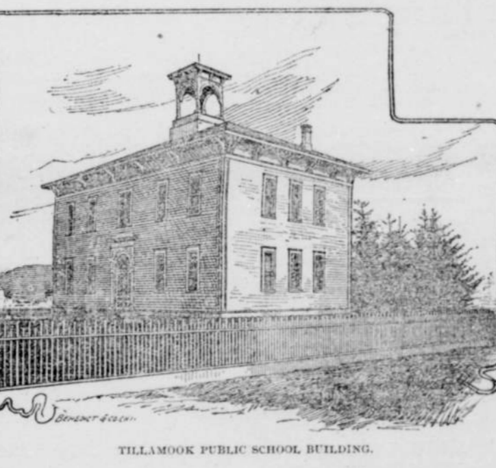
TILLAMOOK PUBLIC SCHOOL BUILDING.

People come to Oregon to locate and find it a good state. But they seldom hear of Tillamook county, the best locality in the state. Heretofore Tillamook has been but little known even in the state. It is easy to construct a sewer system, and a good head of pressure can be easily obtained when