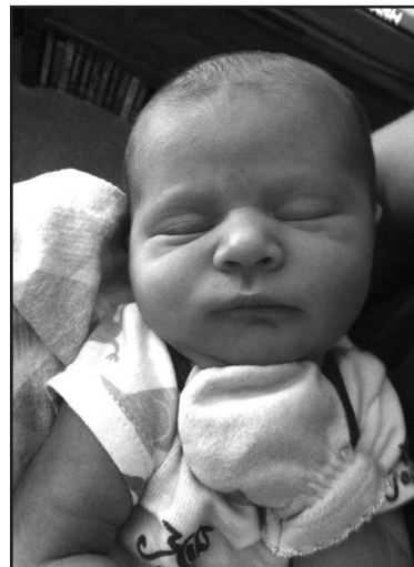
both of Vernonia.