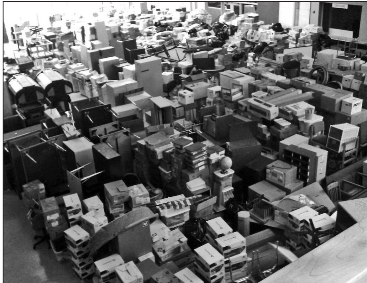
Piles of items moved from the old schools rest in one area of the new school while the rest of the school is finished. See Chalk Talk above for more information on the new schools.

The next regular board meeting will be held August 9 starting at 6:00 p.m.