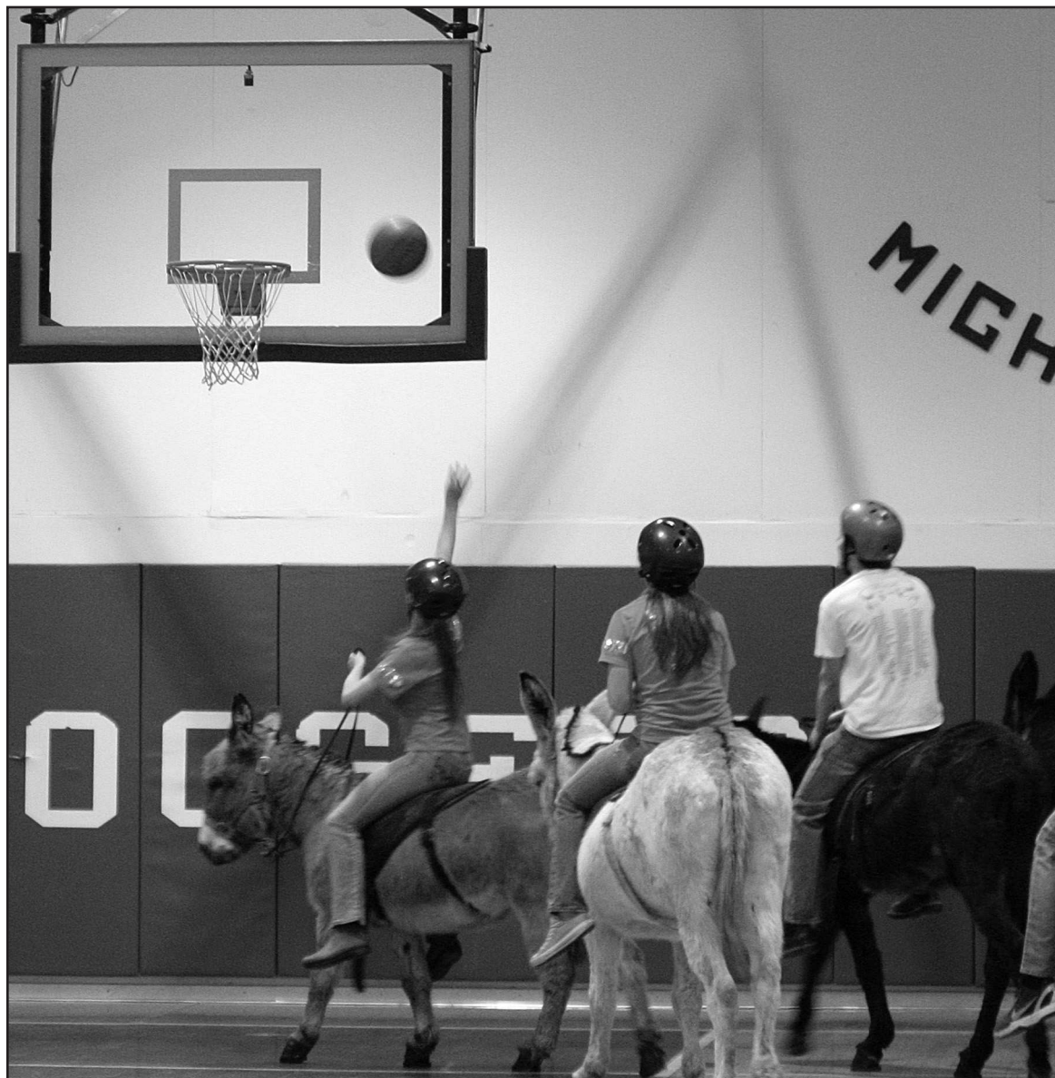
The ball was on the way to the basket when this picture was taken during the Donkey Basketball games, held in Vernonia, on March 24. This game was Juniors against the Seniors and the Juniors won. The other teams were Vernonia Sentry and Vernonia Fire Volunteers.

Students in the St. Helens area attend class at the center on Columbia Blvd. next to Mc Bride School. Families may contact 503-397-4114 for more information.