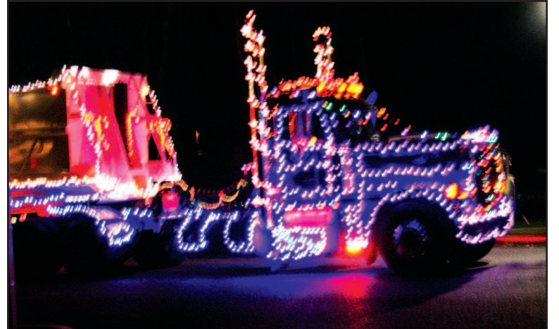
The two pictures above were taken at the Vernonia Lighted Holiday Parade on December 3. The parade was part of a full day of activities and bazaars that included visits with Santa and the lighting of the city Christmas tree.

Make sure all lights and cords are in good condition. If not, replace them. Also don't overload your outlets.