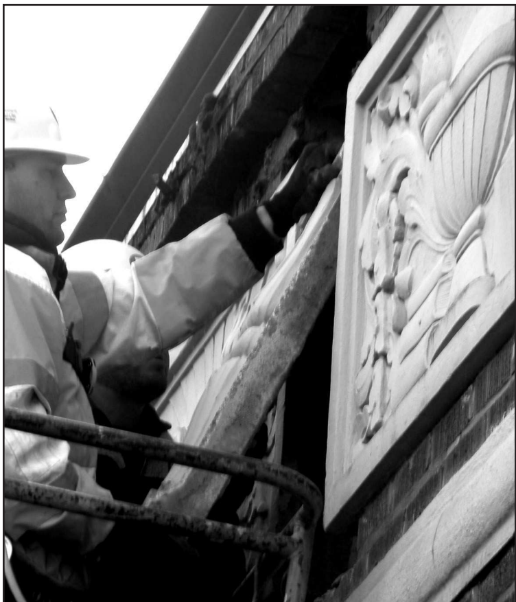
A piece of masonry was removed this week to determine its weight. New Spencer Park will include a historical monument to Washington Grade School. See Chalk Talk above.