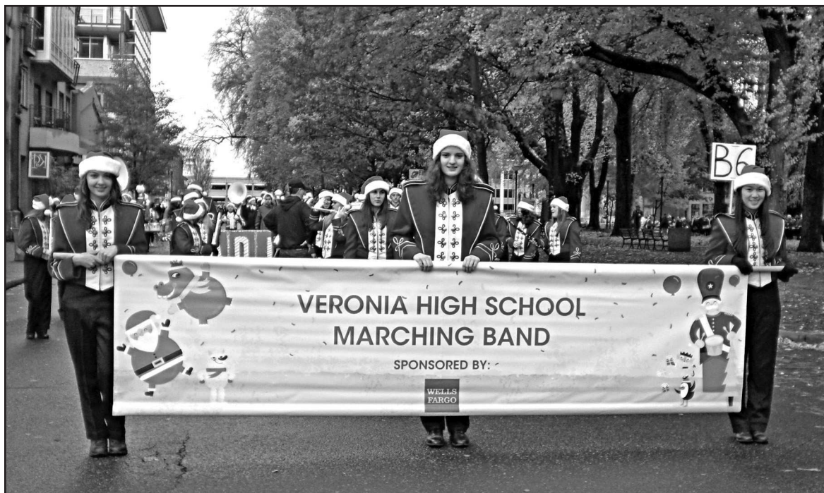
The Vernonia Marching Band was able to march in the 2011 Thanksgiving day Macy's Parade, thanks to sponsorship by Wells Fargo Bank.