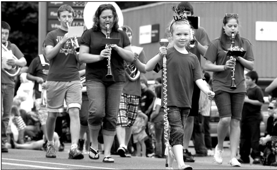
Above, a happy majorette leads the band during the Jamboree parade.

3. When red overhead flashing lights are on, possibly accompanied by an extended stop arm, they tell you the school bus is stopped to load or unload children. State law requires you to stop at least 20 feet from the front or rear of a school bus when red lights are flashing and not proceed until the school bus resumes motion.