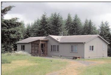
1100 Texas Avenue, Vernonia

Private sanctuary at road's end, 8.5+ wooded acres w/meandering paths & spotless 3 bd, 2 bath dbl-wide w/den, mud room & outbuilding. In the county w/city water. Next to new schools, near Lake & Linear Trail..... $297,000