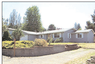
1299 E Alder Street, Vernonia

Looking for a family retreat? Nearly 3 acres, 36'X60' metal shop w/gas heat, big greenhouse, outdoor entertainment area, storage bldg and 2 bdrm mobile home w/great views and Nehalem River frontage. Reduced to.. $139,000