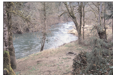
64077 Nehalem Hwy N., Vernonia

Nestled along Bear Creek and a few blocks from down town, this comfy, tidy, 3 bdrm, 2 bath dble-wide features a heat pump w/AC, woodstove, newer roof and paint, dog run, decks, and many upgrades..... $139,000