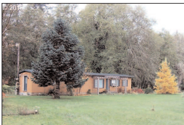
67675 Nehalem Hwy N., Vernonia

A charming country road will lead you to this wooded building site. Over 12.5 acres w/barn, silos, and storage buildings, plus spring-fed water source and septic system. Quiet area West of Birkenfeld..... $199,000