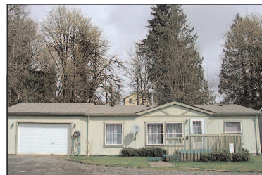
1172 Maple Street, Vernonia

Have a full house? You'll love this immaculate home w/3 spacious bdrms, 2.5 baths, huge FR, comfy LR w/pellet stove, Trek deck, covered porch, dble garage w/opener & storage shed. Next to park & linear trail..... $214,900