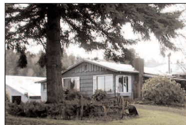
14090 Wallace Road, Mist:

NO WORK! Rambling ranch w/4 bdrms, 2 baths & 2 car garage on a large lot, is NOT a fixer. Kitchen has oak cabinets, handy island & pantry, FR w/view out into private back yard and deck. New paint in & out. $199,500