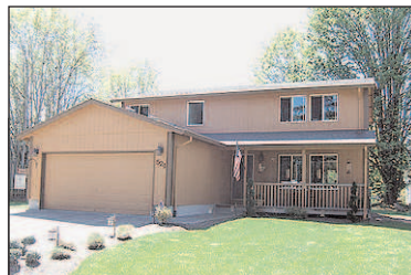
521 Jefferson Ave., Vernonia

Private sanctuary at road's end, 8.5+ wooded acres w/meandering paths & spotless 3 bd, 2 bath dbl-wide w/den, mud room & outbuilding. In the county w/city water. Next to new schools, near Lake & Linear Trail..... $297,000