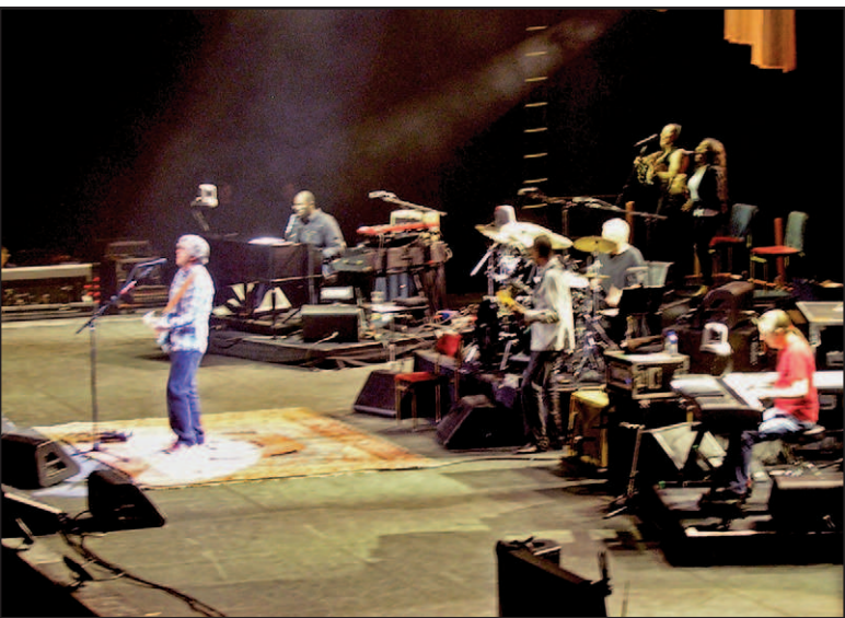
Eric Clapton and His Band at their show on Monday, February 28.