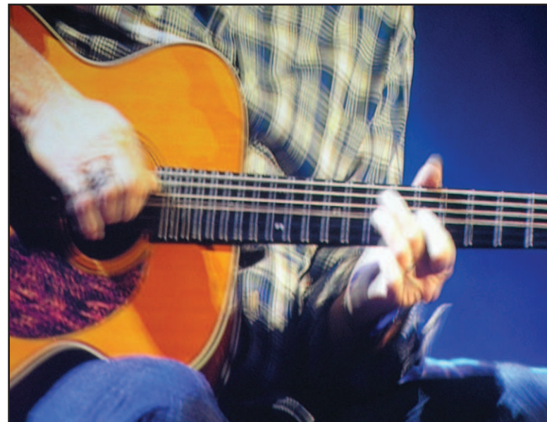
Clapton shows some of his guitar work during the acoustic portion of his show.

South Korea, Vancouver B.C., and Seattle.