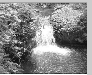
$249,000 - 30 AC Neskowin, extremely private, old homestead, 2 creeks, meadow, mature woods.

$50,000 - 1.42 AC City utilities, Broker owned.