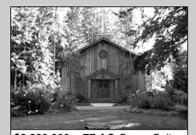
$2,800,000 - 77 AC Camp Colton operates as wedding/event facility w/day & o'night use. Past use as church camp, retreat. Rock bottom creeks, 2 trout ponds, cabins, chapel, mtg hall, shop. Call for CD.