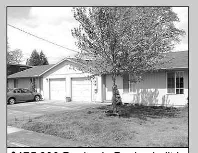
$175,000 Duplex in Banks, built in 1999. Each unit has 3 bedrooms, a fenced yard and single car garage. Each unit rents for $1,000. Good INVESTMENT OPPORTUNITY!