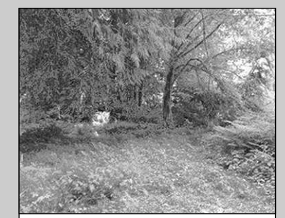
$25,000 - 22 AC Buildable lot with utilities at curb in Fishhawk area. Wooded with homesite