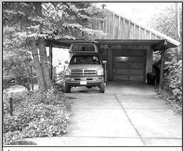
$199,900 Nice, dayranch style home with 3 bedrooms, 2 baths Enjoy privacy and a big yard in the community of Timber.