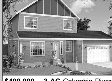
$499,000 - 3 AC Columbia River frontage, sandy beach, view waterfall and creek. Newly constructed 2 story, 2497 sq ft. home.