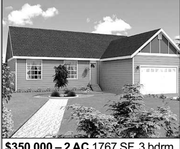
$350,000 - 2 AC 1767 SF, 3 bdrm, 2 ba. proposed new construction. Level, Eastside, private w/barn.