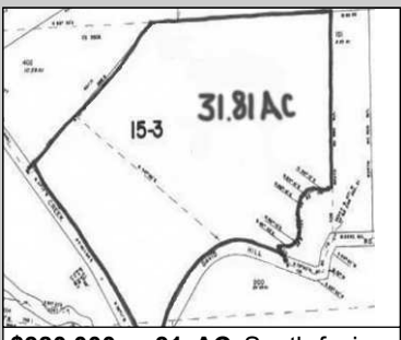
$380,000 - 31 AC South-facing, approval for 2 homes, includes septic systems. Meadows, woods. Forest Grove.