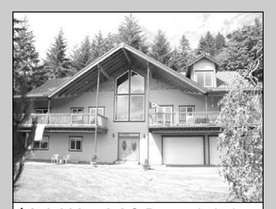
$450,000 - 6 AC Dramatic lodgestyle home w/exceptional quality thruout 4000+ SF. Valley view, 40x50 shop, 36x40 barn. On paved road between vineyards.