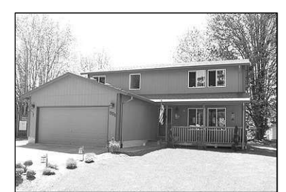
3 SUPER SPACIOUS bdrms, 2.5 ba, huge fam rm, pellet stove, dbl garage, covered porch, sunny deck, lg corner lot, easy care yard....$224,000