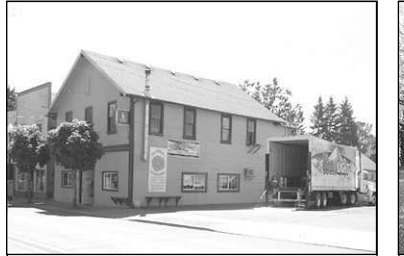
LYON'S DEN Pub & Eatery, well established downtown tavern/bar/restaurant. Potential upstairs apt. Contract to qualified buyers......$320,000