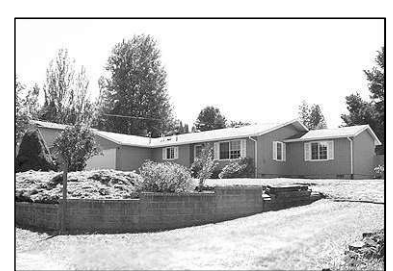
FUSSY BUYER'S DREAM Home! 4 bdrm, 2 bath ranchstyle is absolutely NOT a fixer. On Ig lot w/dbl gar, private back yard..... $199,500