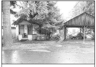
2 HOMES on 100'X115" lot. 2 bdrm, 1 ba main home needs some finish work. 2nd home is gutted. Convenient location near downtown......$80,000