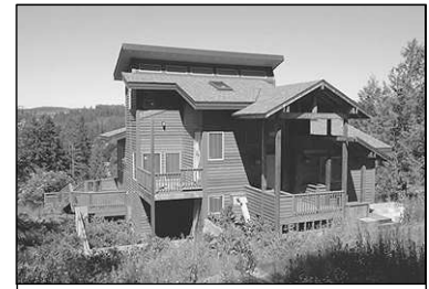
UNDER CONSTRUCTION, unique 2 bdrm, 2 bath, 2196 sf hm on 6 city lots. Views, deck, dbl garage, gas f'place, hardwood & tile flooring...$235,000