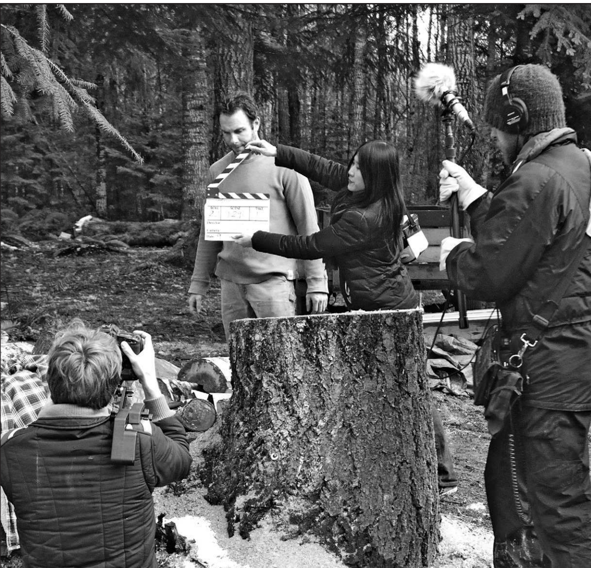
The cameras are ready to roll on this scene from the movie, FRAY , parts of which were filmed in Vernonia. See story below.