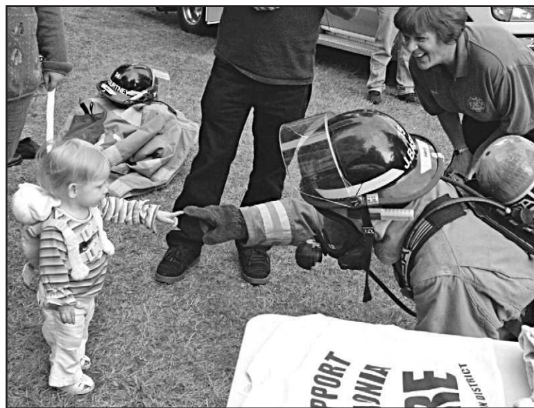
This youngster obviously enjoyed Vernonia Night Out on August 21 at Vernonia's Anderson Park.