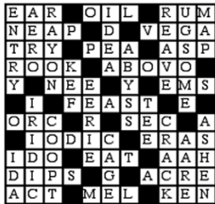
Answer to August 6 puzzle

Help this hungry squirrel get to the acorns