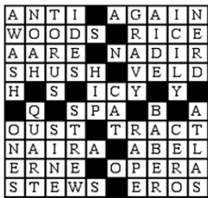
Answer to July 16 puzzle

Color this horse you might see in the Jamboree Parade