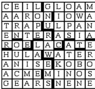
Answer to June 18 puzzle

Here are some 4th of July Stars to color.