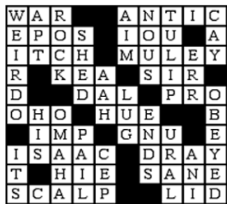
Answer to May 7 puzzle