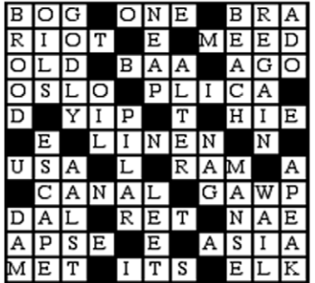
Answer to April 2 puzzle