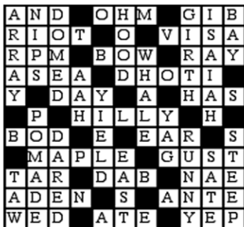
Answer to February 5 puzzle