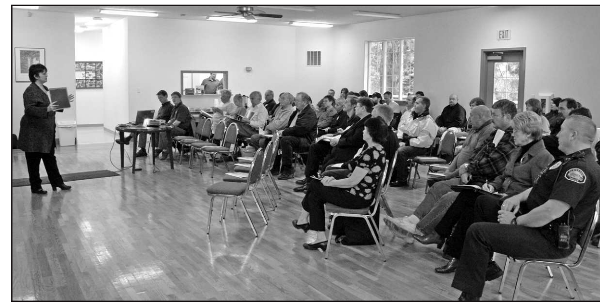
Columbia County Emergency Management, Columbia 9-1-1, National Weather Service and

But - on page 14 of the November 6 issue of this paper I was struck, aghast, at the picture and article. If the people in 1926 were sharp enough to build a raised-board sidewalk along a given stretch of ground where was the brain power in 1952 when folks filled in the duck pond to build the "High" School??? And now you cry what can we do? I'm sorry, I've no more to say, except - you all have known this was coming years ago, not just back in 1996 or 2007. Talk of something making a person sick of heart. This Takes the Cake.