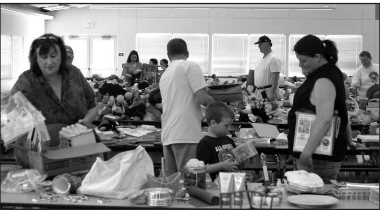
Shoppers took advantage of the items available at the second annual garage sale to benefit the Vernonia school band program, held at the Middle School cafeteria on May 17.