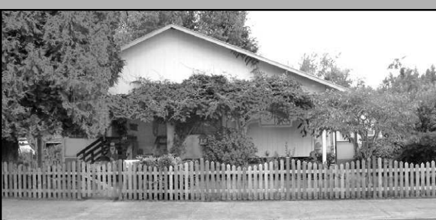
332 "A" Street...$195,000

A great 3bd/2ba home within walking distance to Vernonia Lake! High & dry fenced parcel w/Great Room concept, vaulted ceilings, & gas heatilator fireplace! Master suite has walk-in closet & bath. You'll love the well-planned kitchen! Priced to sell NOW!