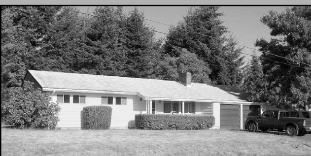
954 Louisiana Avenue...$188,500

Bring the family to this newly completed 4BD/3.5BA home. Master suite on Main floor, 2nd master upstairs. Country kitchen w/pantry and lots of cabinets, unique side entry style, carport/garage pad. All brand new and waiting for you! At $110/sq ft, this is a Best Value!