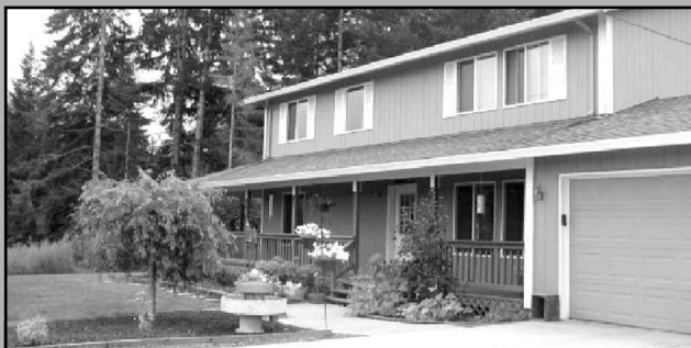
56345 Nehalem Highway, S...$425,000

Imagine owning this beautiful 4096 sq. ft. Craftsman in the country! Add 4.28 beautiful acres & toss in privacy – you get the picture! City water, septic, bamboo flooring, nanny quarters, 4 bd, 3 baths, gourmet kitchen. All at end of tree-lined, paved driveway! It is spectacular!