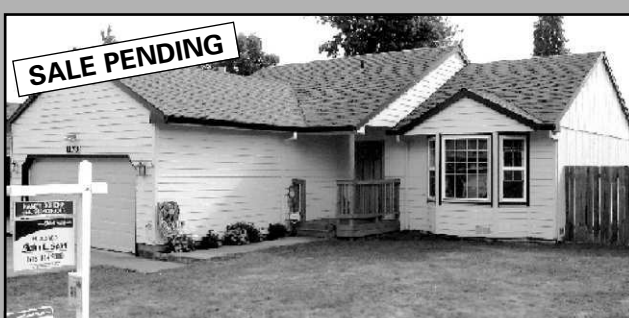
1173 Maple Court...$195,000

Welcome to Creekview Lane, nestled along Rock Creek approx. five miles from Vernonia off Keasey Road! Unique .59 parcel has septic approval & improved road leading to home site. If you like natural settings where the fish and wildlif play, this property is for you!