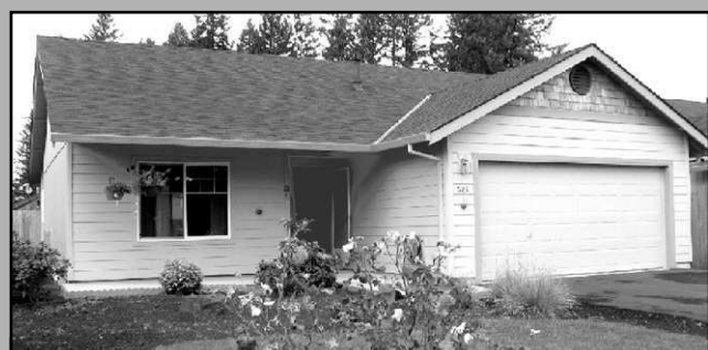
681 E. Bridge Street...$220,000

Welcome to this beautiful "gem" of a home! Remodeled 3bd/2ba delight has view of Rock Creek and is OUT of the flood plain! Bright, light kitchen w/nook, dining rm leads to nice deck, fenced yd, 2-car garage. For a cyber-tour, log onto www.275EStreet.com