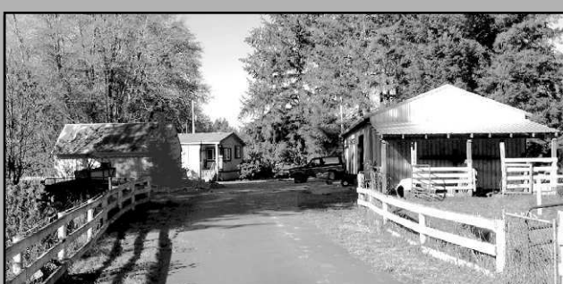
67791 Nehalem Highway North...$325,000

Family Compound or Investment? Seller will finance w/only $20,000 down & 7% int. w/30-year amortization & negotiable terms on the note. Over 1600 sq ft remod home PLUS 32x78 heated shop w/bath PLUS 2nd residence. Homes DID NOT FLOOD in 1996 or 2007.