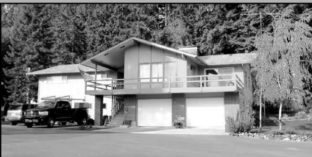
18122 Keasey Road...$519,000

Imagine owning this beautiful 4096 sq. ft. Craftsman in the country! Add 4.28 beautiful acres & toss in privacy – you get the picture! City water, septic, bamboo flooring, nanny quarters, 4 bd, 3 baths, gourmet kitchen. All at end of tree-lined, paved driveway! It is spectacular!