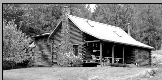
26530 Dairy Creek Road, North Plains...$629,000

Quality craftsman out of the flood plain! Sweet 3BD/2BA ranch style home features Great Room floor plan! Security system, skylights, tiled kitchen w/eating bar, dining room w/slider to nicely fenced, private yard w/an outbuilding. This has it all & won't last!