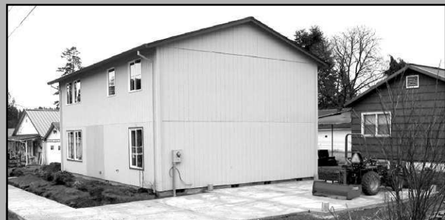
1037 Clatsop Street...$229,750

Like privacy? If you do, here is one of the largest parcels in Vernonia! 4bd/2.5ba, airy kitchen, lg family room, formal living, wrap-around porch, hot tub, hobby shop, ATV trails! Relax & de-stress in this well-priced home only 20 minutes to Sunset Corridor!