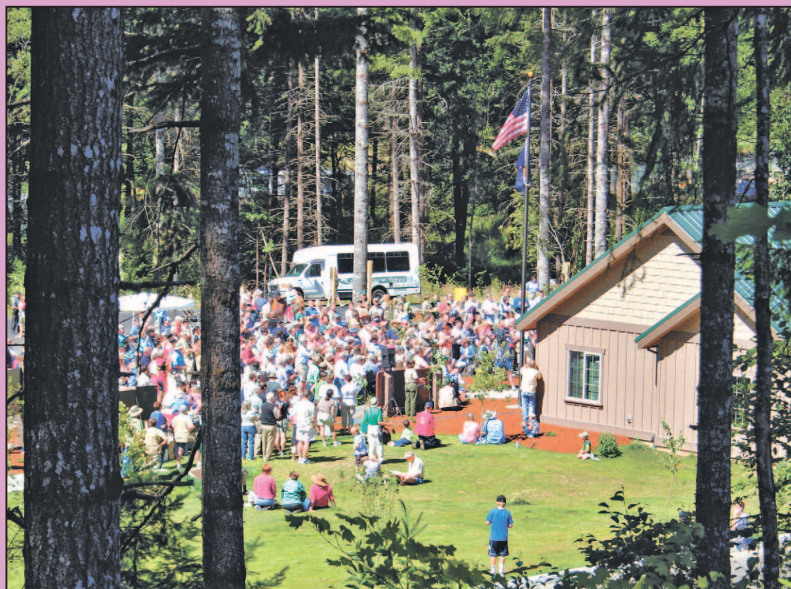
Happy throngs turned out for the opening of Stub Stewart State Park, July 7, and have kept the park full much of the time since the opening.