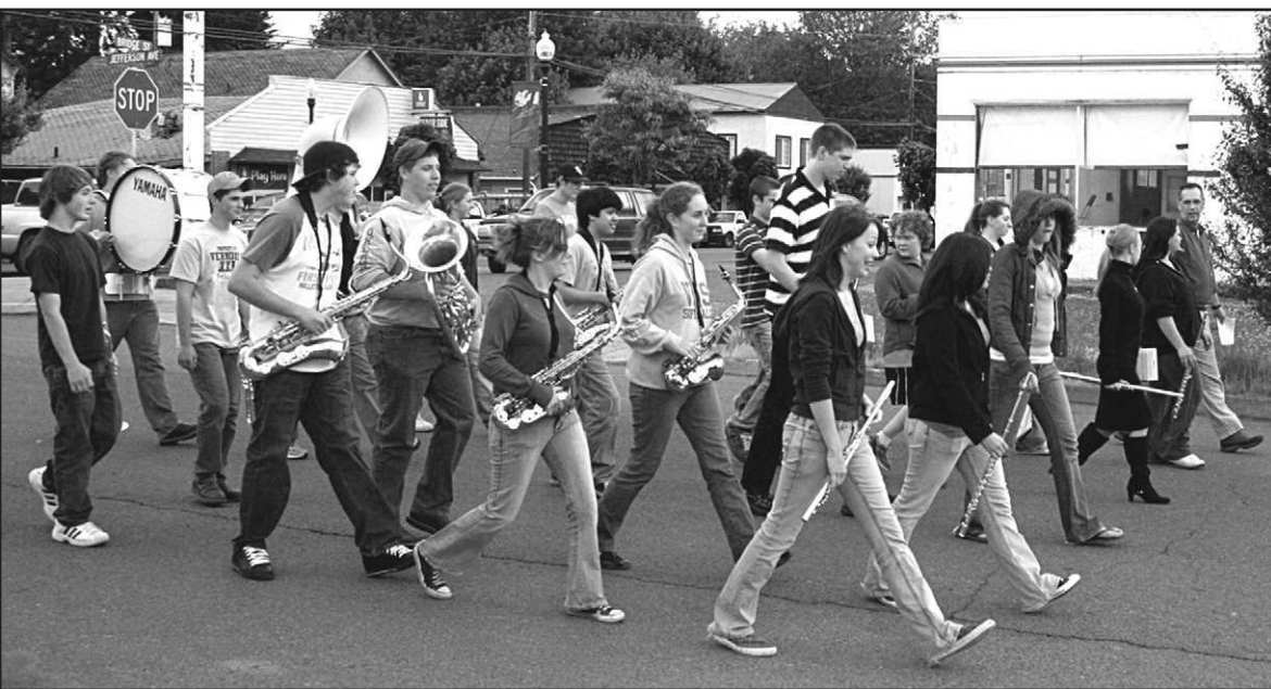
Left; on June 5, the Vernonia Band marched downtown to kick off their fundraiser to bring Dallas Brass to Vernonia in February of 2008. Watch for opportunities to help them raise the money.