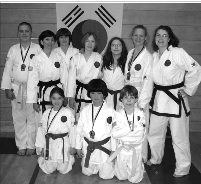
Vernonia's tae-kwon-do group in a picture taken at the tournament.