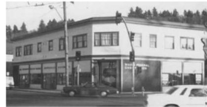
Astoria Branch 1978

Wauna Federal Credit Union began on March 16, 1967 by a group of men involved in the startup of one of the world's largest paper mills located in Wauna, Oregon. As we come upon our 40th Anniversary, we want to thank our members for all the memories!