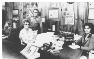
Westport Branch 1979

Wauna Federal Credit Union members and families are invited to attend!