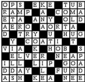
Answer to January 18 puzzle