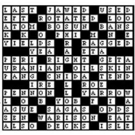
Answer to January 4 puzzle